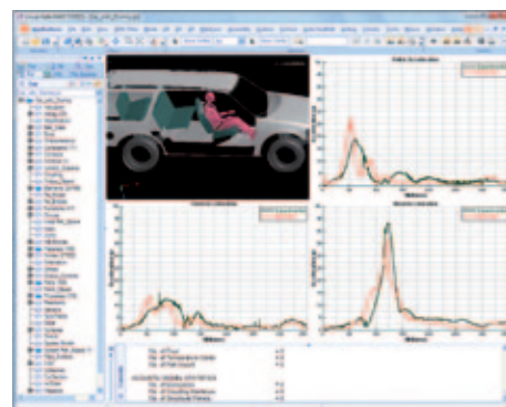
Visual-Safe MAD's Graphical User Interface

Vector Scientific used Madymo software to analyze the movement and injury response of the human body to impact and ESI's software Visual-Safe MAD to process and analyze the simulation output.